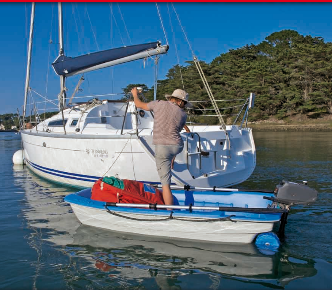
SPORTYAK BIC 245