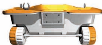
On the BIC 245 the wheels are integrated into the design of the hull