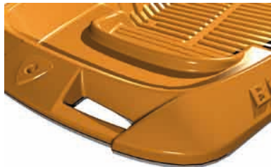
Front carry handle

The various carry handles make the boat easy to carry for one or more people. It weighs in at just 39 kg, making it easy to load onto a roof rack.